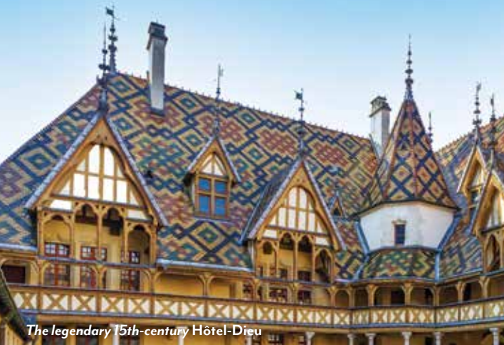
The legendary 15th-century Hôtel-Dieu